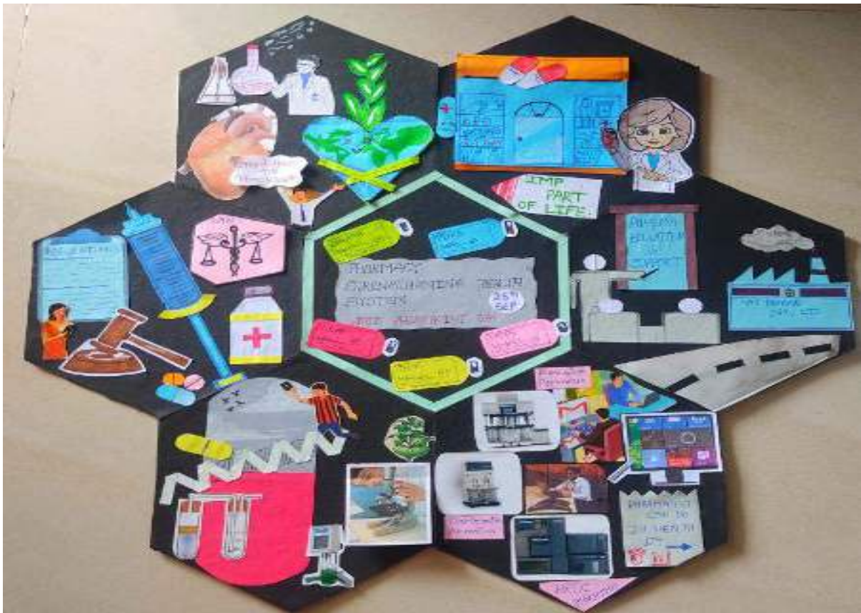
WINNER FOR POSTER MAKING COMPETITION: Gayatri B. Alaspure